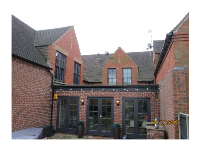
Existing rear elevation and relationship with neighbouring properties.